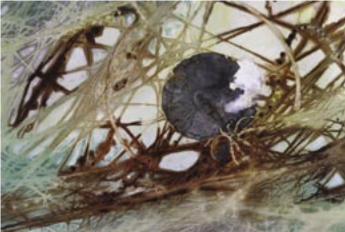
The Eye of the Spider , Lynda Jung, Porter, TX