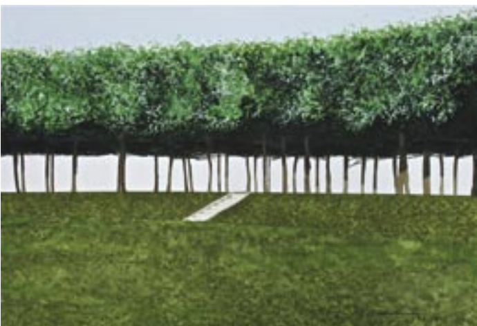
Seven Steps To Tree Line , Arthur Sekula, Jacksonville, TX