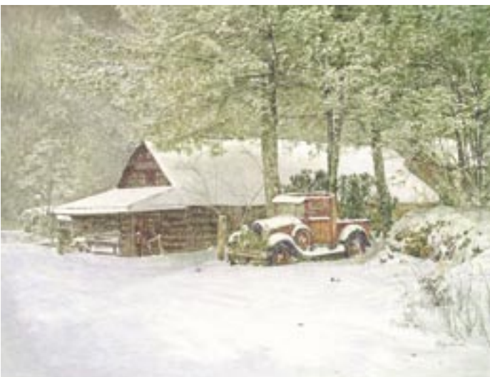
Mountain Morning , Corky Goldman, Mobile, AL