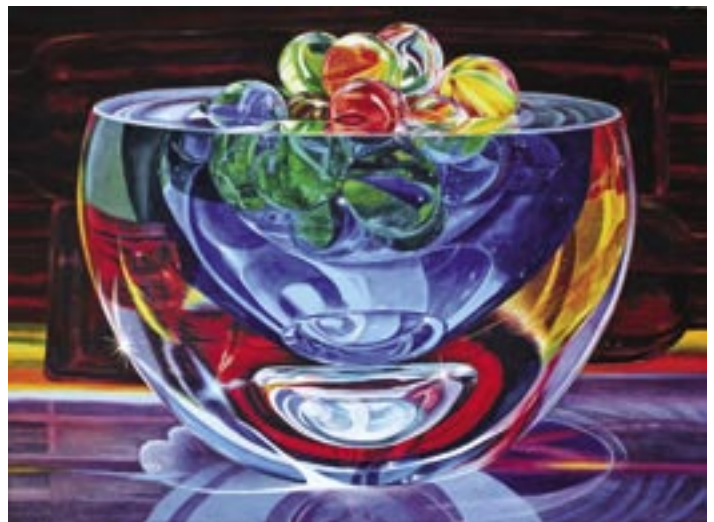
Golden Light in Marbles , Soon Warren, Fort Worth, TX