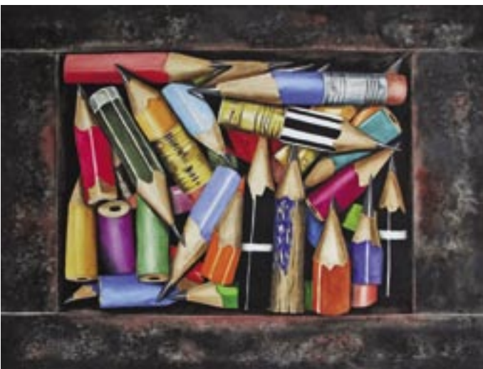
Practice Makes Perfect , Lynn Nebergall, Greenwood Village, CO