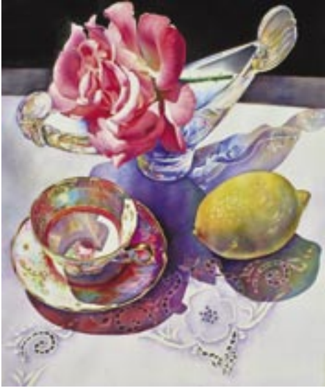
Table In The Sun , Olga Greco, Lexington, NC