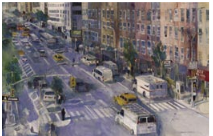
Going Home - View From The Port Authority , Dorrie Rifkin, Englewood, NJ