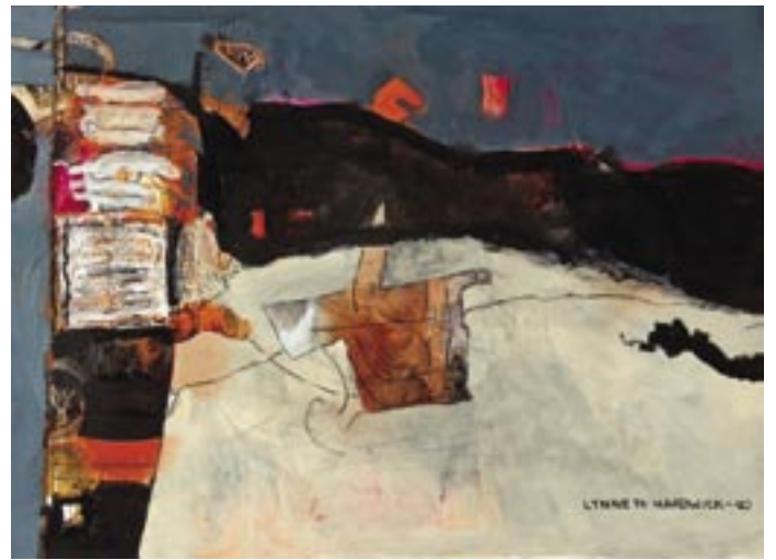
Kazakh X , Lynne Hardwick, Summerville, SC