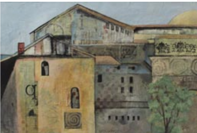
Building Blocks , Dorothy Lyons, Houston, TX