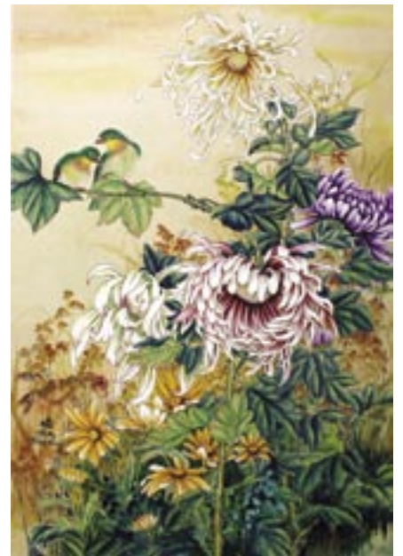
Spirit Of Chrysanthemum , Peihong Endris, Pearland, TX