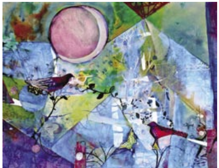
The Enchantment , Lynne Kroll, Parkland, FL