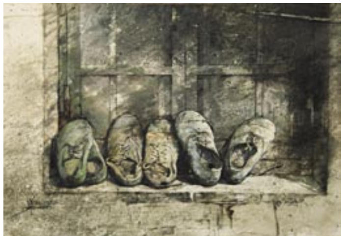
The Story of Shoes , Hong Shan, Qingdao, China