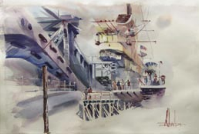
Visiting USS Yorktown , Radu Dumitrescu, Bucuresti, Romania