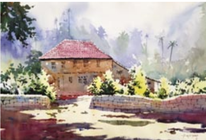
It's Sunny Today , Sujit Sudhi, Kenosha, WI