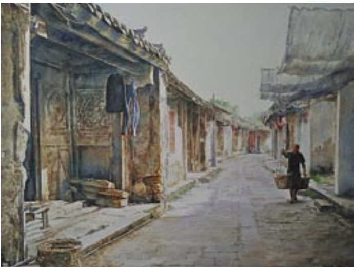
Old Town , Shihai Ren, Longjing, China