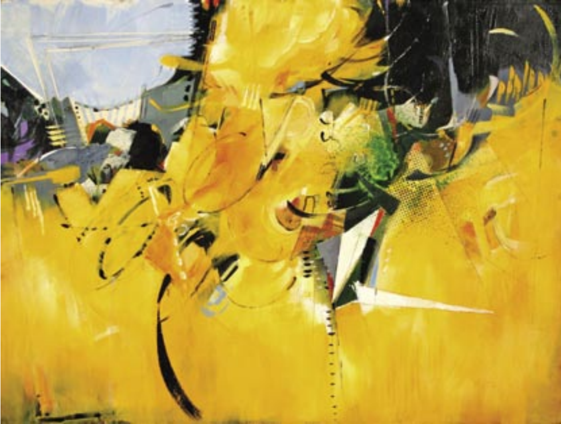
Within Bounds III , Denise Athanas, Mt. Pleasant, SC