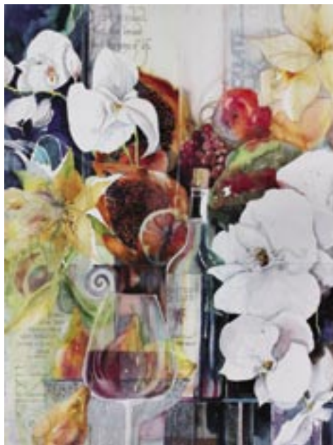
Art & Wine , Susenne Telage, Weston Lakes, TX