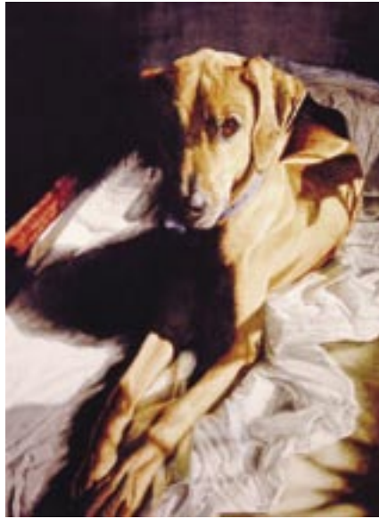
Foot Of The Bed , Robbie Fitzpatrick, Magnolia, TX