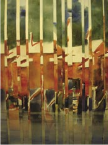
Compromise Solution , Kathy Collins, Lake Forest Park, WA