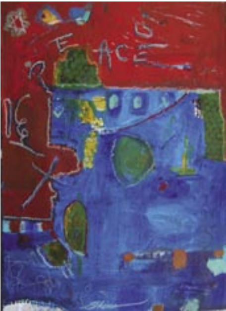
Peace #2 , Toni Elkins, Columbia, SC